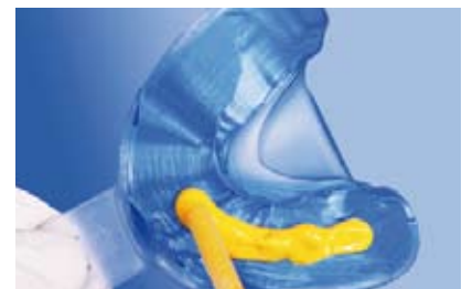
Fig. 4 Honigum-Light is applied over the Honigum-MixStar Putty