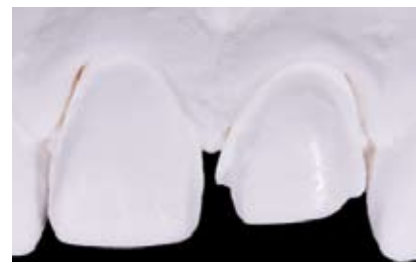
Fig. 9 Stone cast of the prepared teeth