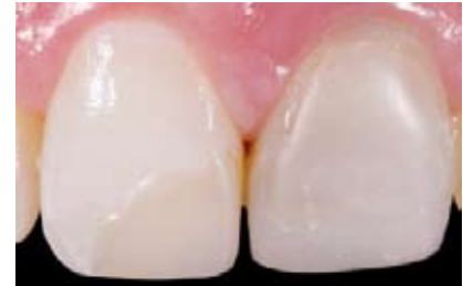
Fig. 1 Preoperative view of teeth 11 and 21 showing defective restorations

Bonded porcelain veneers were suggested to correct the teeth shape and restore the discoloration as well as convey a pleasant esthetic appearance. An alginate impression was taken and poured in type IV synthetic dye to analyze the interocclusal relationship. An additive wax-up was used to establish the correct contour of the central incisors. 9 A silicone matrix was made from the diagnostic wax-up and used as guide for the teeth preparation. 10 The patient was not anesthetized to control the depth of preparation. Tooth 11 received a minimal preparation of 0.3 mm thickness, leaving the preparation entirely on the enamel. For tooth 21, a preparation depth of 0.5 mm was performed at the entire facial surface. The difference in preparation depth for each tooth was used to compensate for the gray discoloration. After the preparation, the tooth was acid-etched with 37% phosphoric acid gel for 15 seconds, washed and air-dried. A simplified total-etch dentin adhesive (TECO, Silvr Dose, DMG, Hamburg, Germany) was applied to tooth 21, and light cured for 20 seconds. Next, an A1 opaque composite colorant was used at the gingival third to mask the gray discoloration. The prepared teeth were then polished with rubber points and prepared for impression. A double cord technique was used for deflexion of the soft tissues. The large retraction cord was left in place for 5 minutes before impression (Fig. 2). After the initial