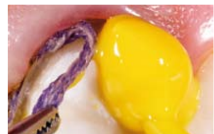
Fig. 5 Honigum-Light is applied at the same time the retraction cord was removed