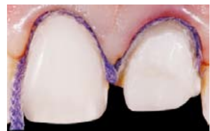
Fig. 2 Preparations ready for impression showing double cord retraction technique