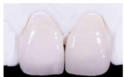
Fig. 10 Lingual view of the porcelain veneers