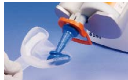
Fig. 3 Impression tray carefully and homogeneously filled with the Honigum-MixStar Putty