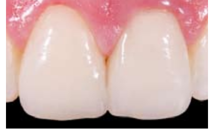
Fig. 11 Final outcome revealing a satisfactory esthetic appearance